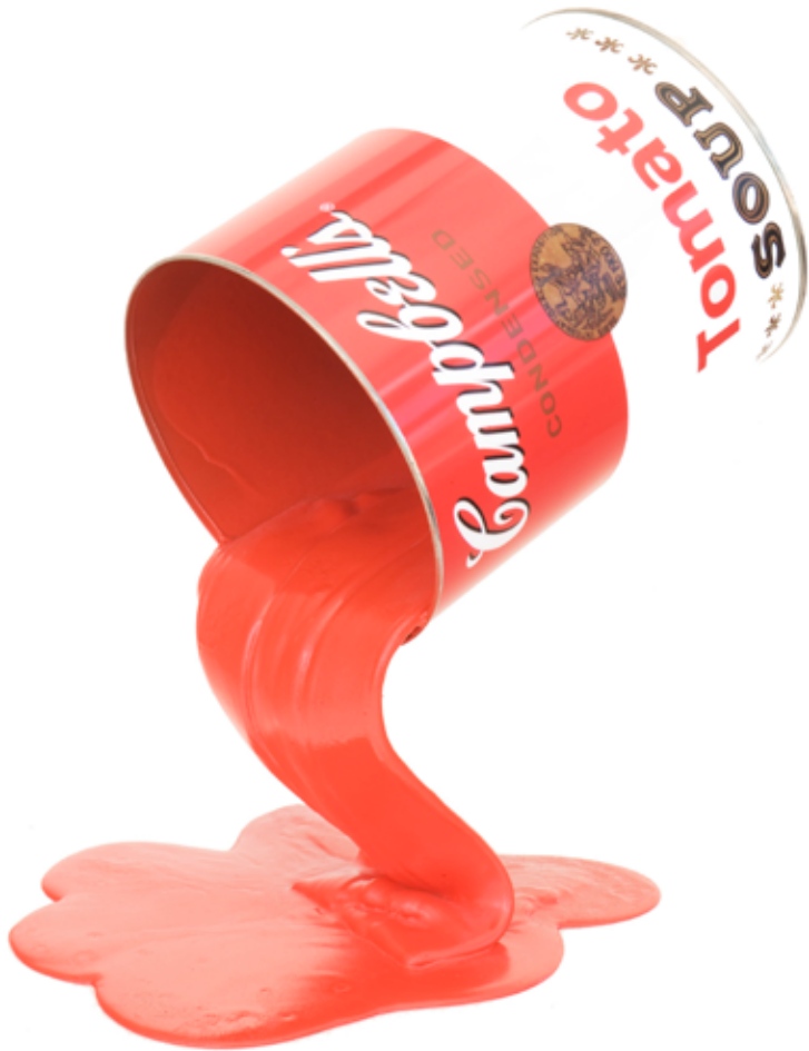
Tomato Soup Medium