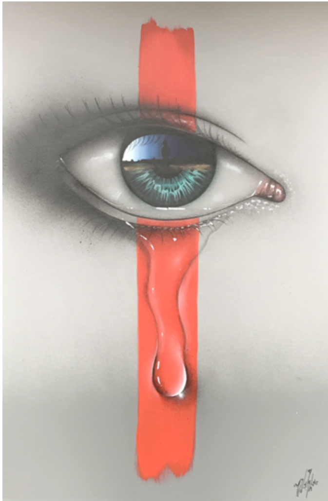
I'm missing something