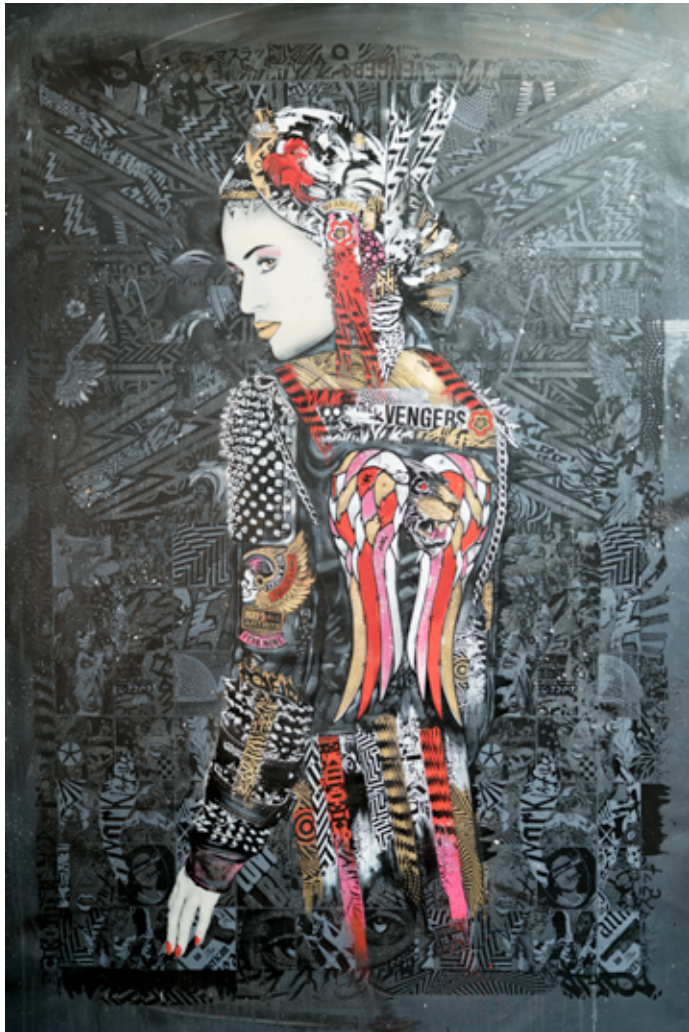
Hearts and Knives