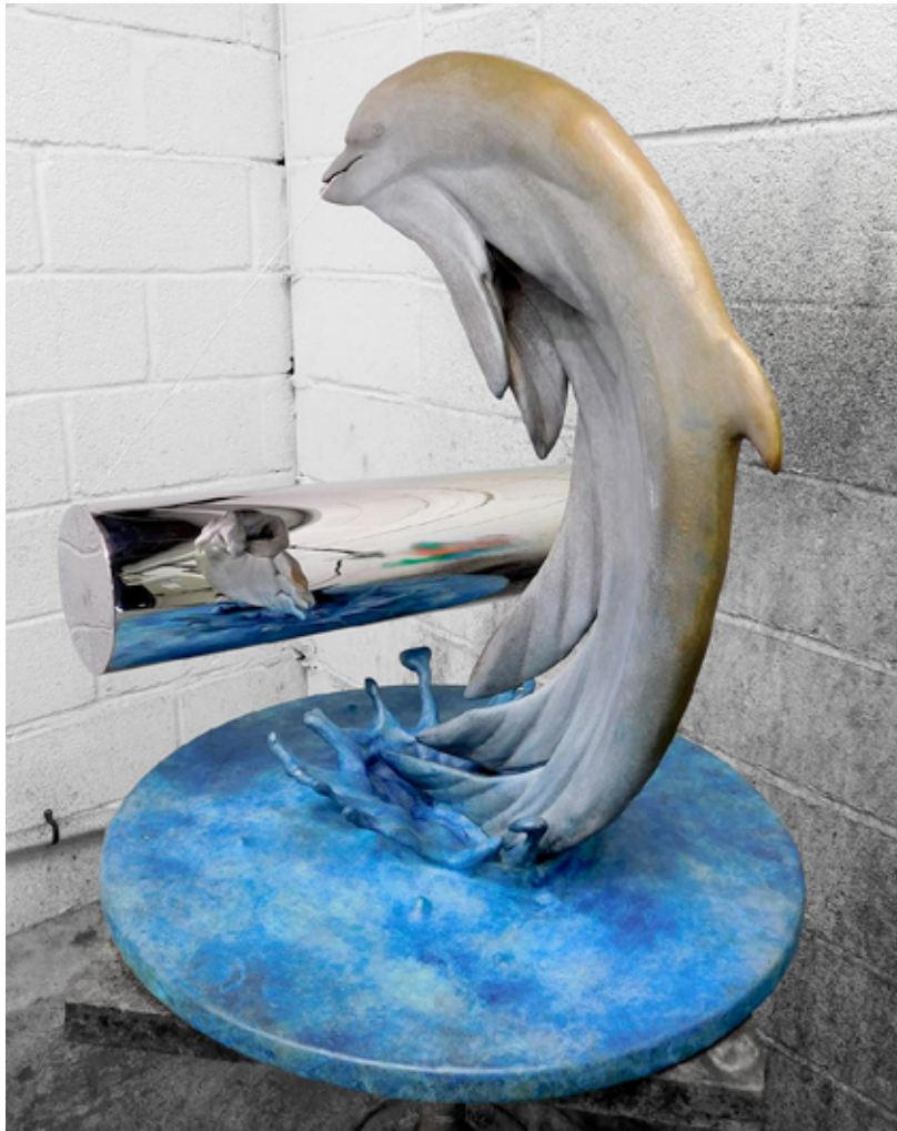
The fluid consciousness of all time