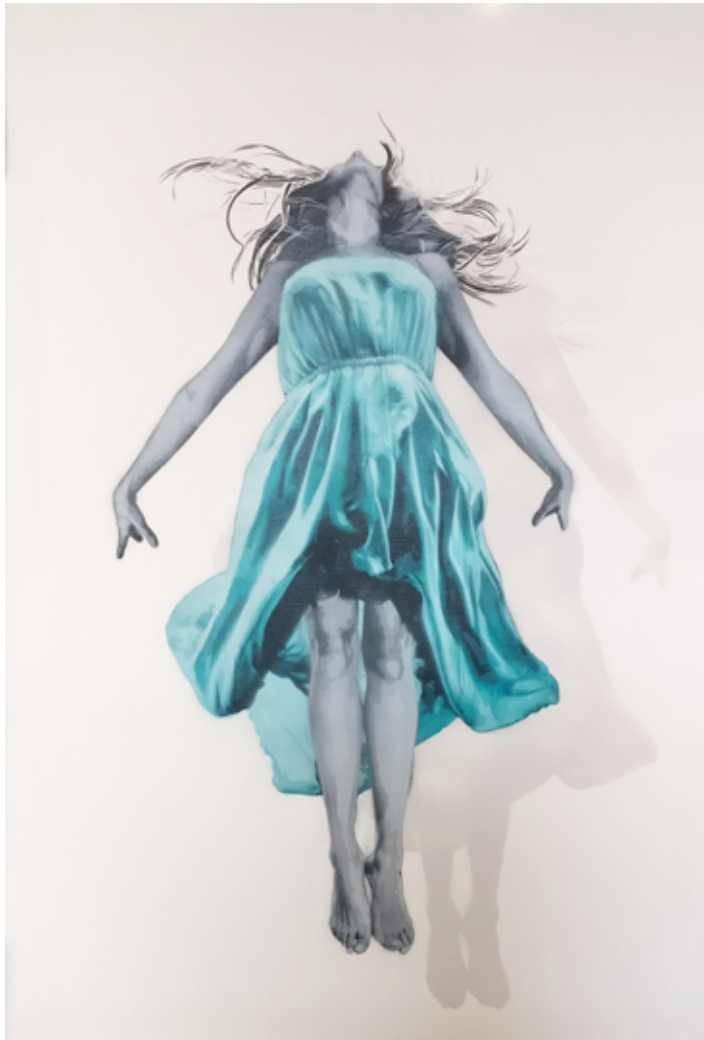
Fix the sky (blue)