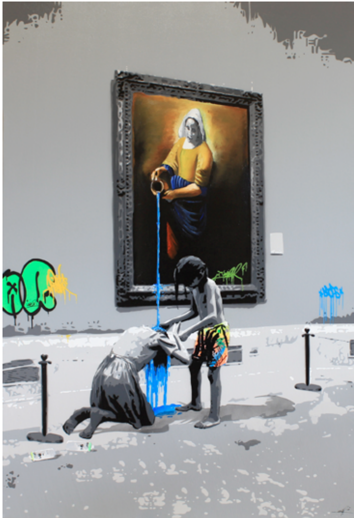
Art's washing my mind 51,2 x 35 in | 130 x 89 cm