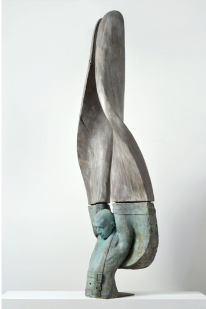
Helicoide II / 2