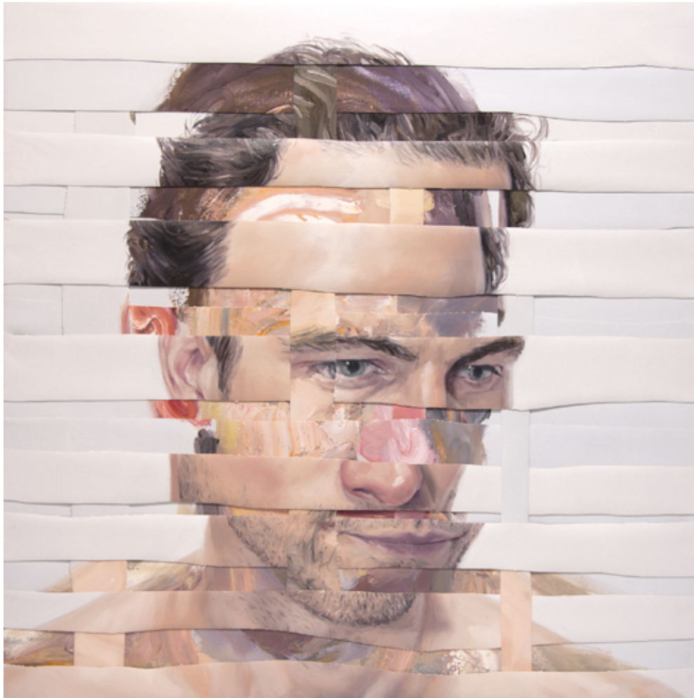
Psychoanalysis Composition V